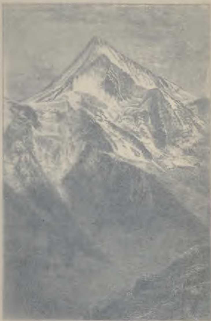
THE MOUNTAIN, FROM THE PETERSBURG